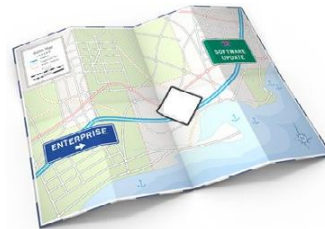
BENCHMARK - ROADMAP